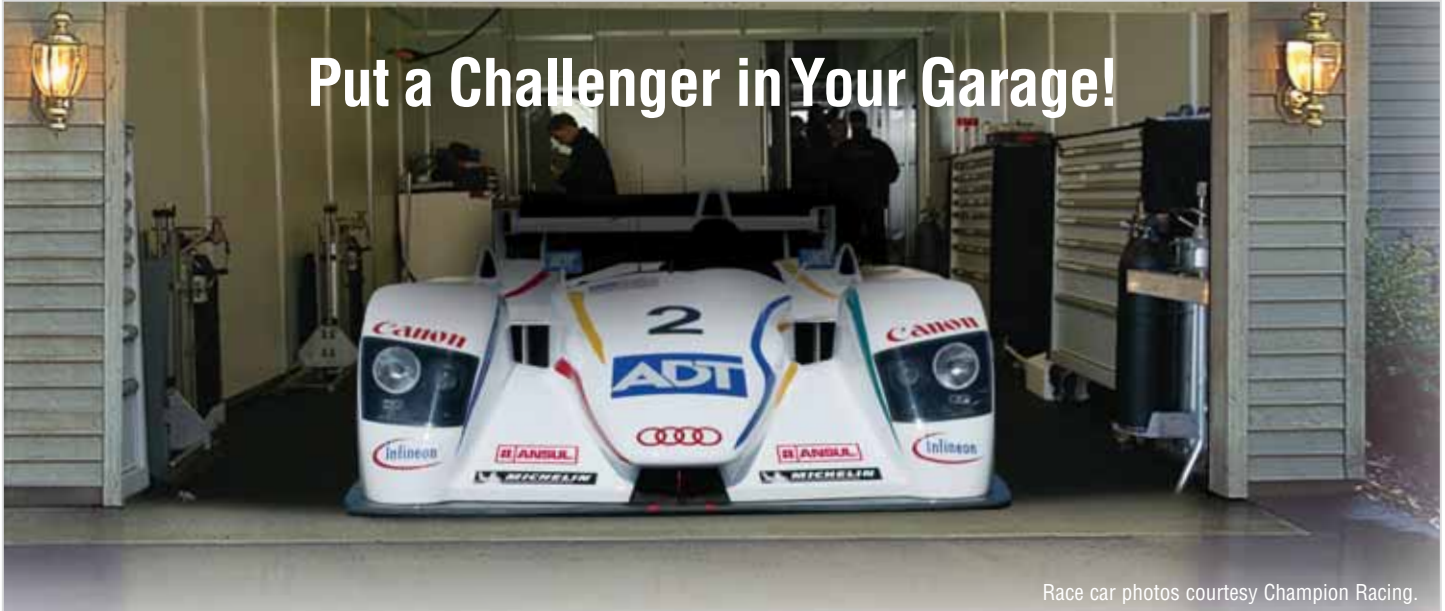
Race car photos courtesy Champion Racing.