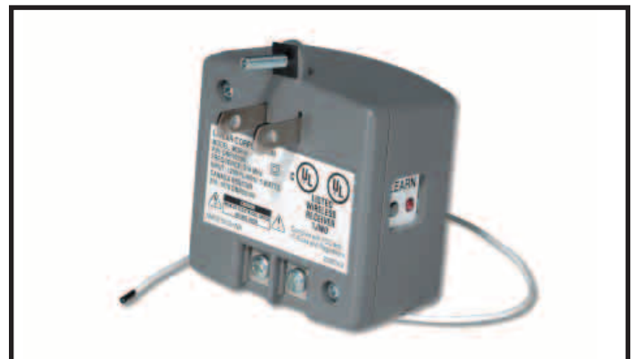
MDR/U (DNR00100) 1-Channel Plug-in Receiver (Substitute)

All these brands are now under one name.